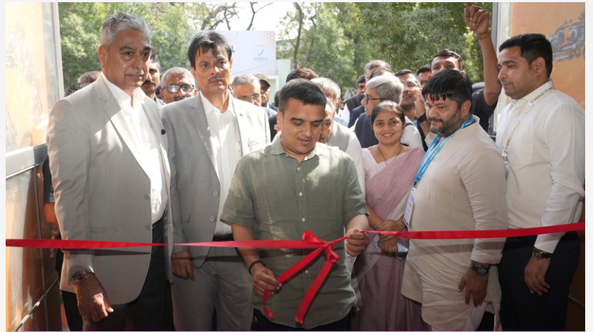
Inaugurated by Shri Harsh Sanghavi , Hon'ble Deputy Chief Minister of Gujarat

estimated value of business inquiries generated