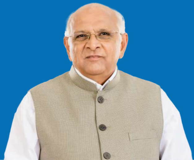
Shri Bhupendrabhai Patel Hon'ble Chief Minister of Gujarat