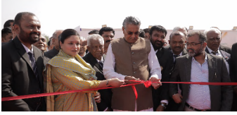
Hon'ble Smt. Poonamben Maadam, MP and Shri Raaghavjibhai H. Patel, Cabinet Minister