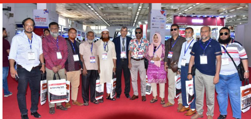
22 Delegates from Bangladesh