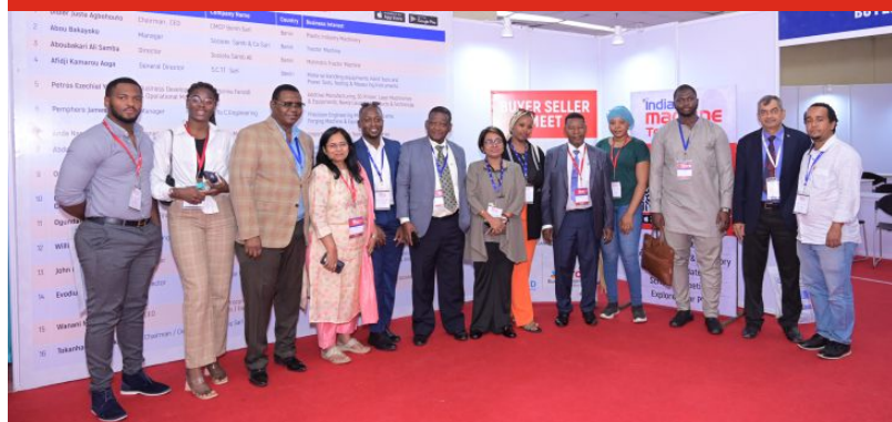
16 Delegates from Tanzania, Mali, Mozambique, Benin, Ivory Coast, Burkina and Faso.