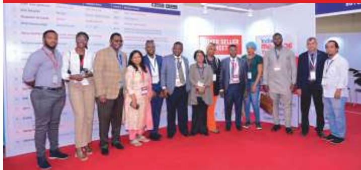
16 Delegates from Tanzania, Mali, Mozambique, Benin, Ivory Coast, Burkina and Faso.