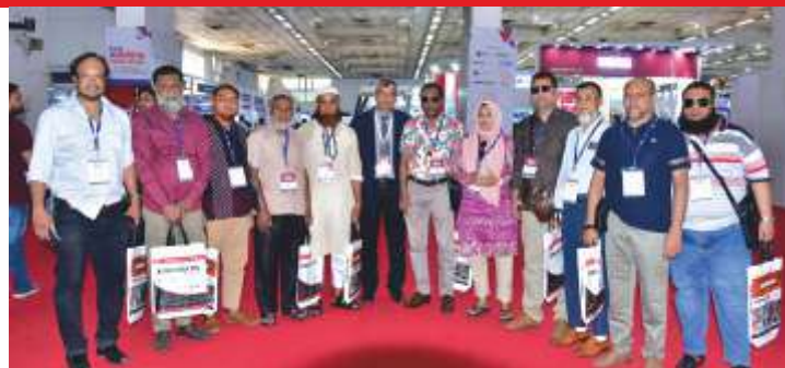
22 Delegates from Bangladesh