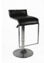
MI-11 Bar Stool

Description: Bar stool frame in chromium finish,