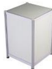
MI-12 Display Podium

Description: White aluminium System frame, White laminated side & Top Panels