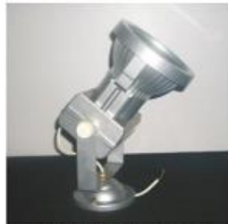
MI-20 Metal Halide

Description: Indian Type 2 outlets point with independent control switch. Max Power load 1 kW