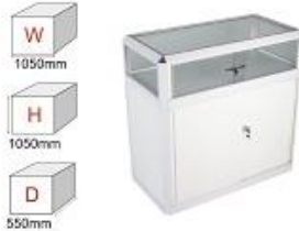
MI-16 Glass Counter

Description: White aluminium system frame, 202mm high Glass, cabinet underneath with sliding shutter