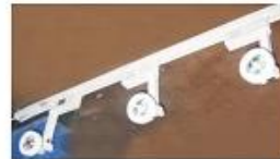
MI-21 Track Spot (950mm Long track)

Description: White Track, 3 Nos of white spots, 12/50 watts, Adjustable focus