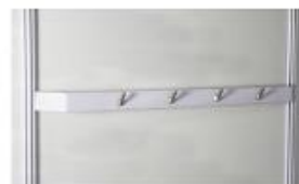
MI-24 Wall Coat Hanger 950mm-Dia

Description: White System, Anodized coat Hooks