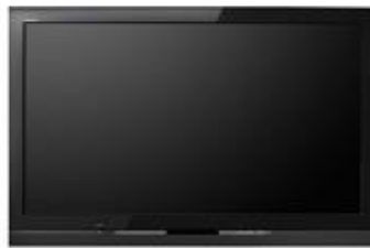
MI-26 LCD TV

Description: 42" LCD with DVD player and stand