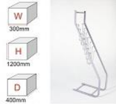
MI-15 Literature Stand

Description: White Metal frame with provision for Display of 6 Nos Catalog A-4 size