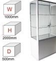
MI-18 Glass Showcase

Description: White aluminium System frame, 1500mm high clear fixed Glass on 3 sides, Lockable sliding Glass shutter, 2 adjustable Glass shelf, 2 down light