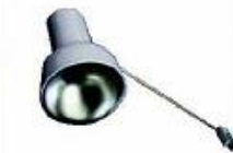
MI-22 Standard Long Arm Spot Light (75 watts) 250mm long arm

Description: White Casing, Chromium arm, Adjustable Focus