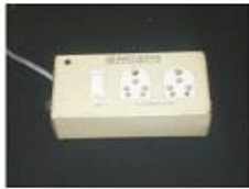
MI-19 Socket Outlet (Max. 1kW)

Description: White aluminium System frame, 1500mm high clear fixed Glass on 3 sides, Lockable sliding Glass shutter, 2 adjustable Glass shelf, 2 down light