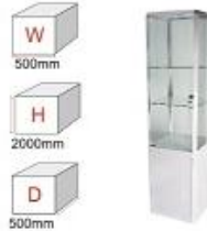
MI-17 Glass Showcase

Description: White aluminium System frame, 1500mm high clear fixed Glass on 3 sides, Lockable hinged Glass shutter, 2 adjustable Glass shelf, 1 down light