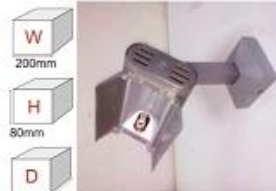
MI-23 Halogen Spot (300 watts)

Description: White Casing, Chromium arm, Adjustable Focus